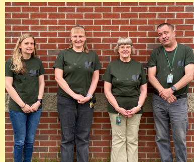
2nd Place winners of the Come Alive Outside Walking challenge! Go Bear Paws!